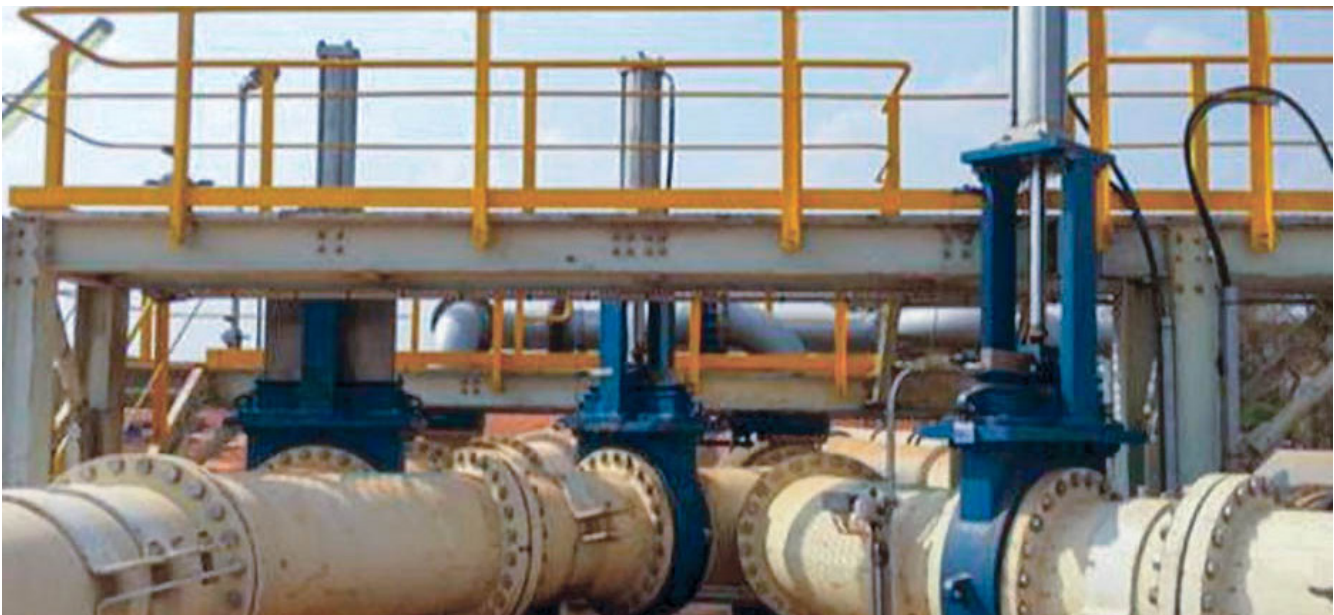
DeZURIK KSV Severe Service Knife Gate Valves installed in a tailings slurry pump isolation application. The KSV valves lasted 14 times longer than the push through style valves in this challenging service.

DeZURIK recommended the KSV Severe Service Knife Gate valve with hard faced overlay metal seats to handle the turbulent application. KSV valves are specifically designed to handle highly erosive slurry applications. The valve is bi-directional, drip-tight and suitable for dead-end service without a mating flange. KSV valves are designed for safety with a full-force lockout system to handle the full actuator force plus safety factor. The enclosed design KSV valves have not failed to atmosphere and are lasting 3.5 years. That is 14 times the service life of the push through style valve. In addition to the extended service life, the identical dual seats provide increased flexibility for maintenance to address unscheduled shutdowns.