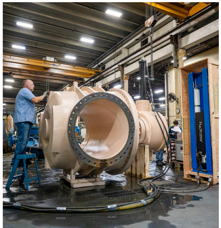
The 42" Willamette Metal-Seated Cone Valve (VMC) is tested prior to shipment.

The Willamette Cone Valves were selected due to their energy-efficient operations, robust design, and reliable performance. These attributes make them an ideal choice for the pump control needs of the facility.