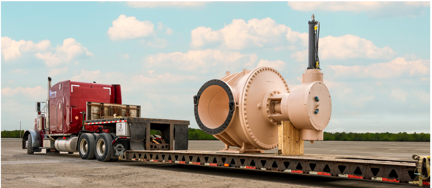
42" Willamette Metal-Seated Cone Valve (VMC) from DeZURIK loaded and ready to make the long journey from Minnesota to New York.