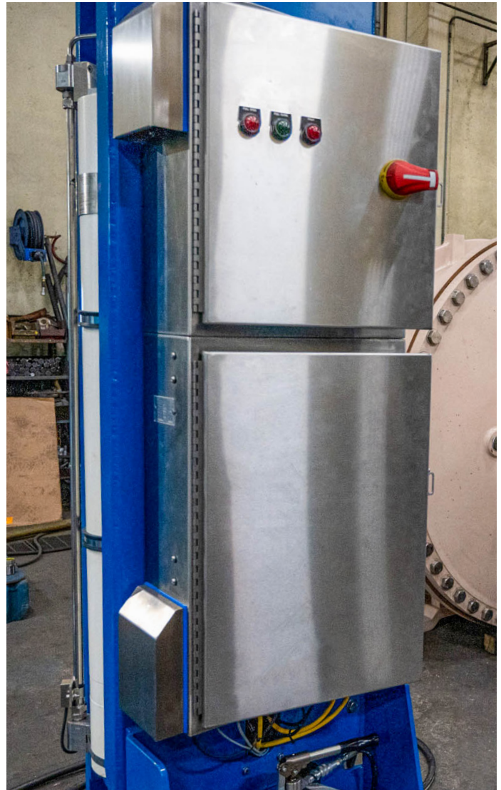
The DeZURIK HPU's were custom engineered to have a specified footprint.

The comprehensive approach taken by the DeZURIK team highlights innovation and commitment to enhancing the resilience and efficiency of the Coney Island Wastewater Treatment Plant. The selection of Willamette Cone Valves for their durability and cost-effectiveness, coupled with versatile DeZURIK Hydraulic Power Units, demonstrates a forward-thinking strategy for infrastructure design. These solutions prioritize longevity, efficiency, and adaptability, ensuring the facility remains a reliable public utility for the community it serves.