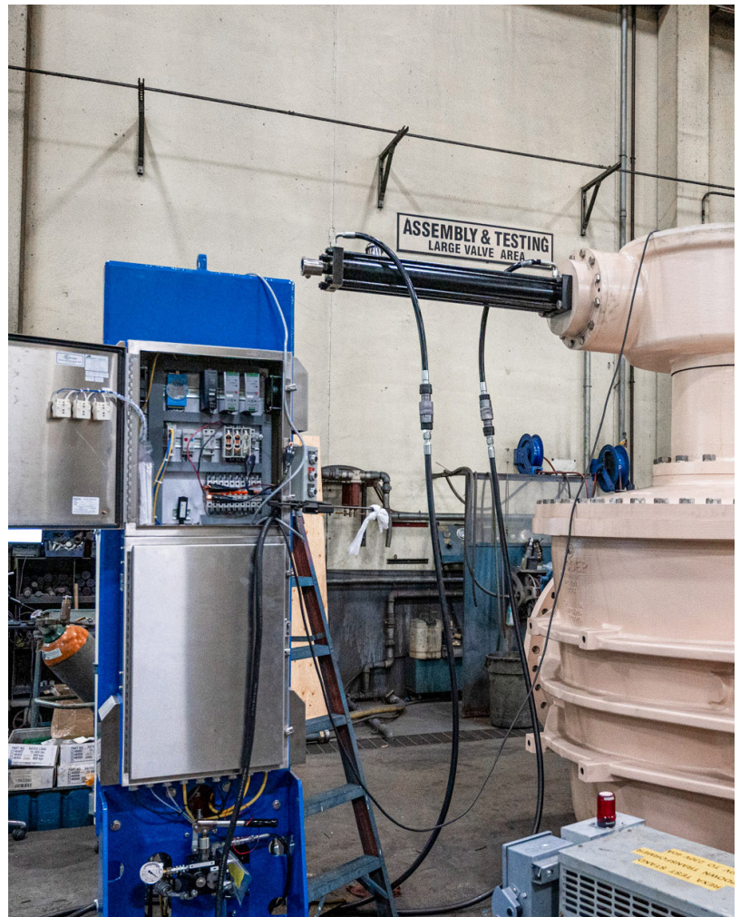
DeZURIK HPU's add necessary resilience and control to water treatment facilities.