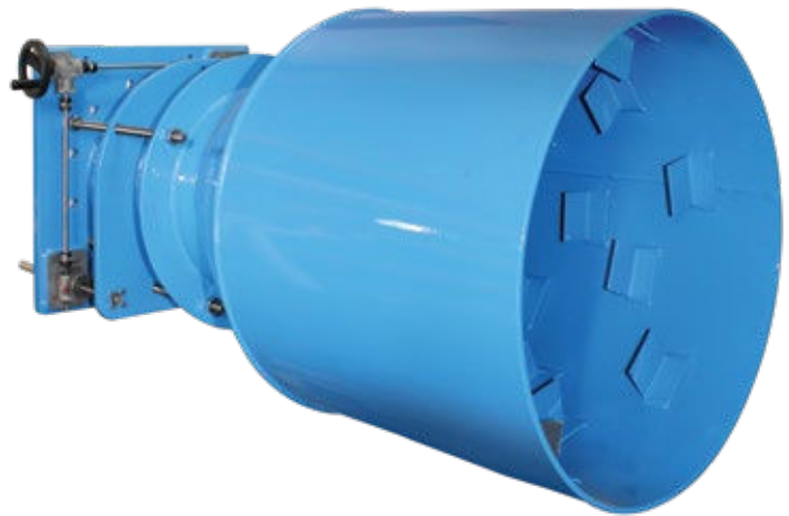
12" Fixed Cone Valve With Baffled Hood Used For Performance Testing At Utah State University Water Research Laboratory