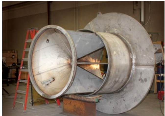
60" Fixed Cone Valve Body, Fabricated from 304 Stainless Steel & Nitronic 60

Hilton Valves have been successfully applied in free discharge applications in the hydropower industry since 1975. This extensive experience with hydro applications enables Hilton application engineers to provide recommendations and assist with specifications for consulting engineers and utilities. Hilton Jet Flow Gates utilize heavy duty construction and are based on the original US Bureau of Reclamation designs. In addition, Hilton pioneered the use of Throttling Knife Gate Valves as another alternative to Jet Flow Gates and Fixed Cone Valves in appropriate applications.